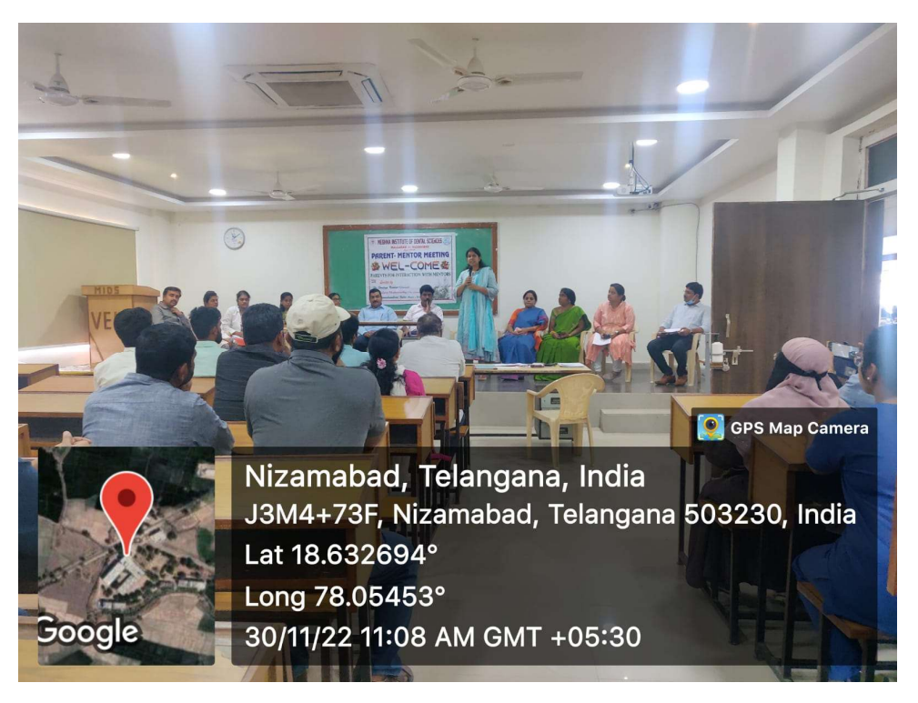
MENTOR MENTEE PROGRAMME – 2022 (NOV 30)